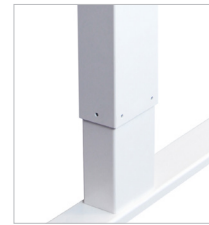
2 level column: 645-1145 mm