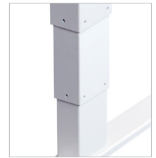
3 level column: 560-1210 mm