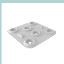
Fittings for desktop connection (2 pcs.)