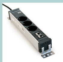
Power socket blocks