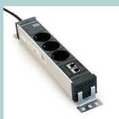
Power socket blocks