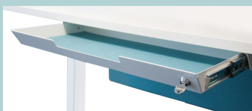
Felt-lined metal drawer with lock