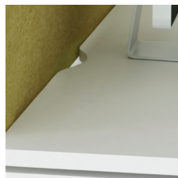
Desktops with a scallop for wire management