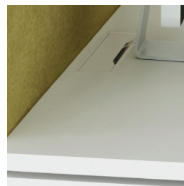
Desktops with a cut-out for grommet and wire