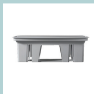
Plastic grommet with a box