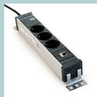
Power socket block