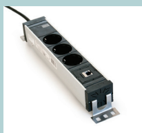
Power socket blocks