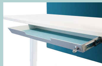
Felt-lined metal drawer with lock