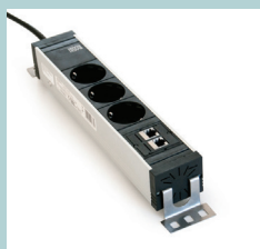
Power socket blocks