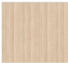
D3 - Sand Ash