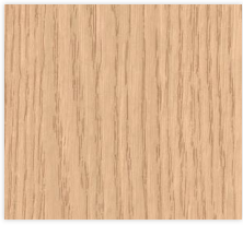
D1 - Whitened oak