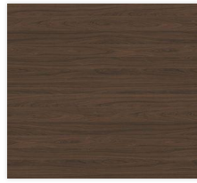
D4 - Dark walnut