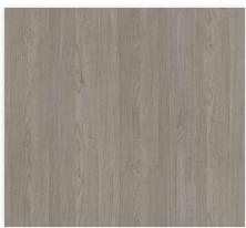
D5 - Grey wood