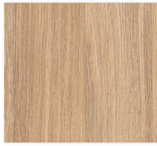
D2 - Amber oak