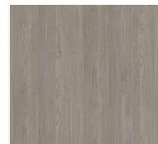
D5 - Grey wood