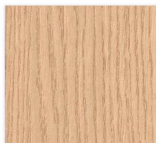
D1 - Whitened oak