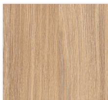
D2 - Amber oak