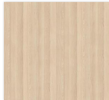
D3 - Sand Ash