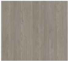
D5 - Grey wood