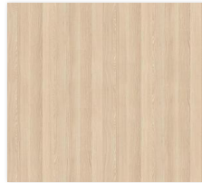
D3 - Sand Ash